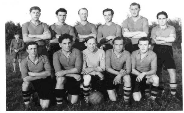
Lockerbie Ukrainian POW camp football team