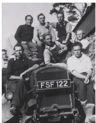
POW camp tractor group