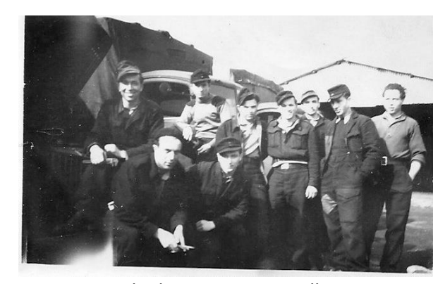
Drivers in Lockerbie POW camp Hallmuir