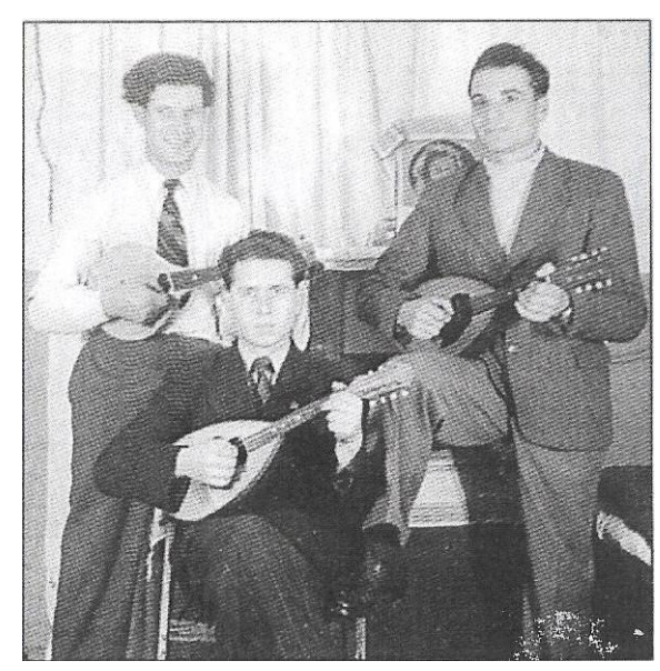
1947 Gala day entertainment provided by the Ukrainian mandolin trio