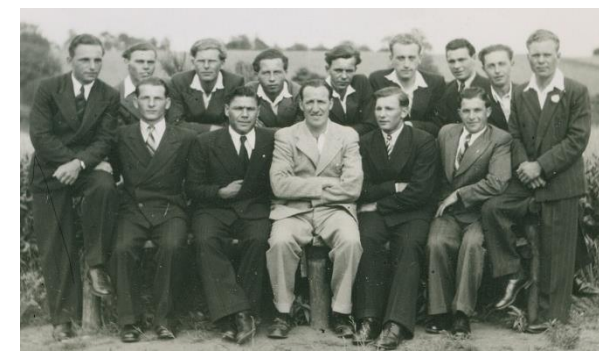
Lockerbie camp chauffeurs with the camp commandant