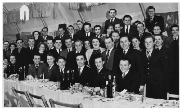
1947 Xmas party Lockerbie POW camp Hallmuir