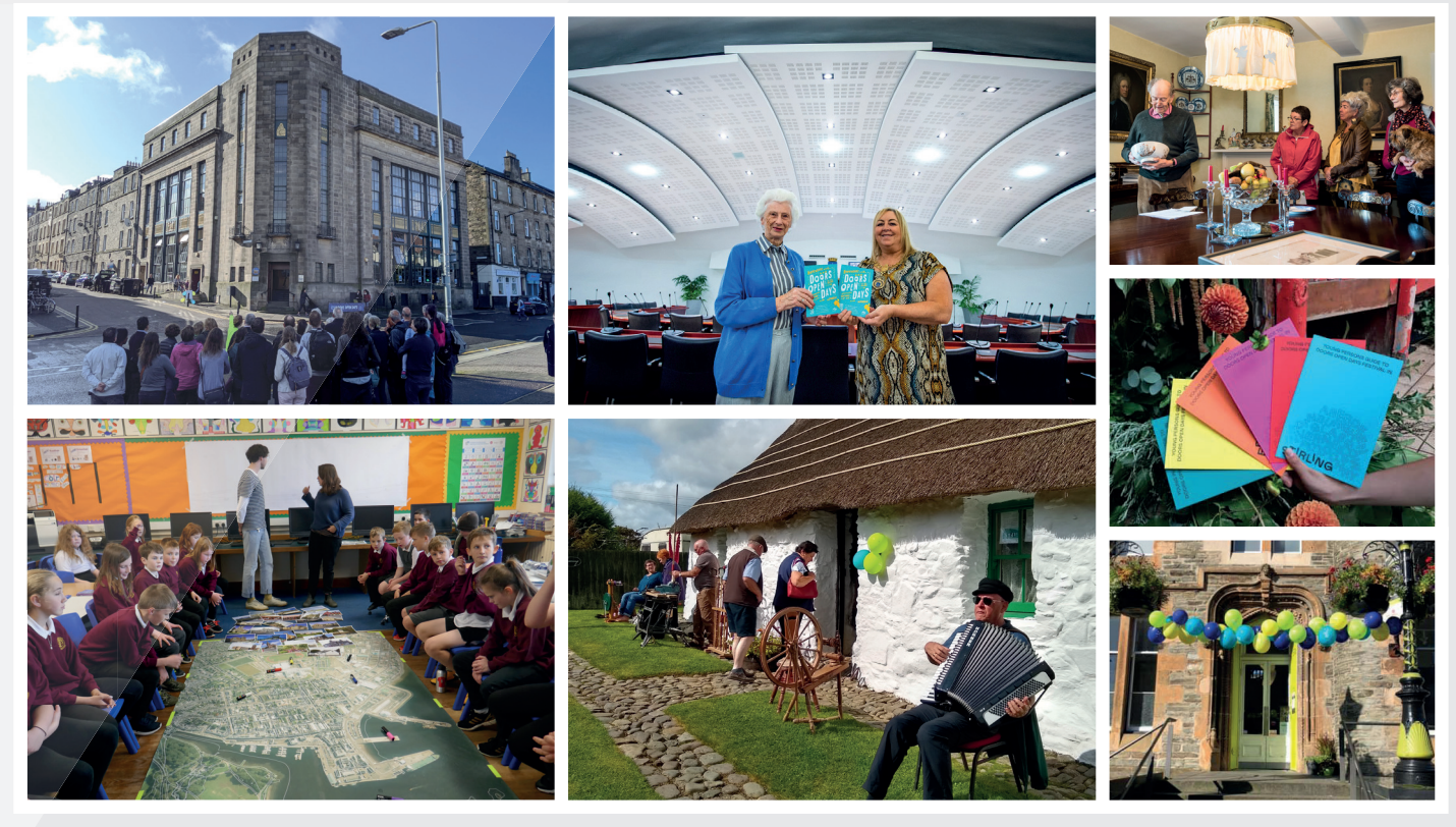
The Scottish Civic Trust is a charity registered in Scotland. No. SC012569

Statistics are based on a sample of 2,658 visitor surveys (2.85% of visitors) and 952 event organiser surveys.  Icons in this report were made by Pixel perfect from www.flaticon.com